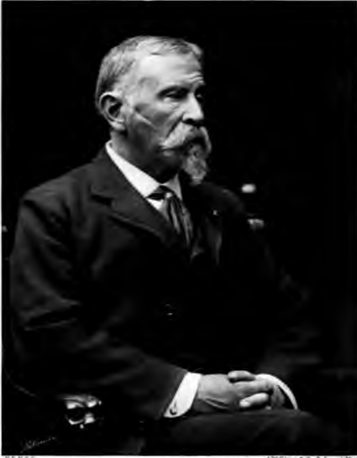
Henry Lee Higginson